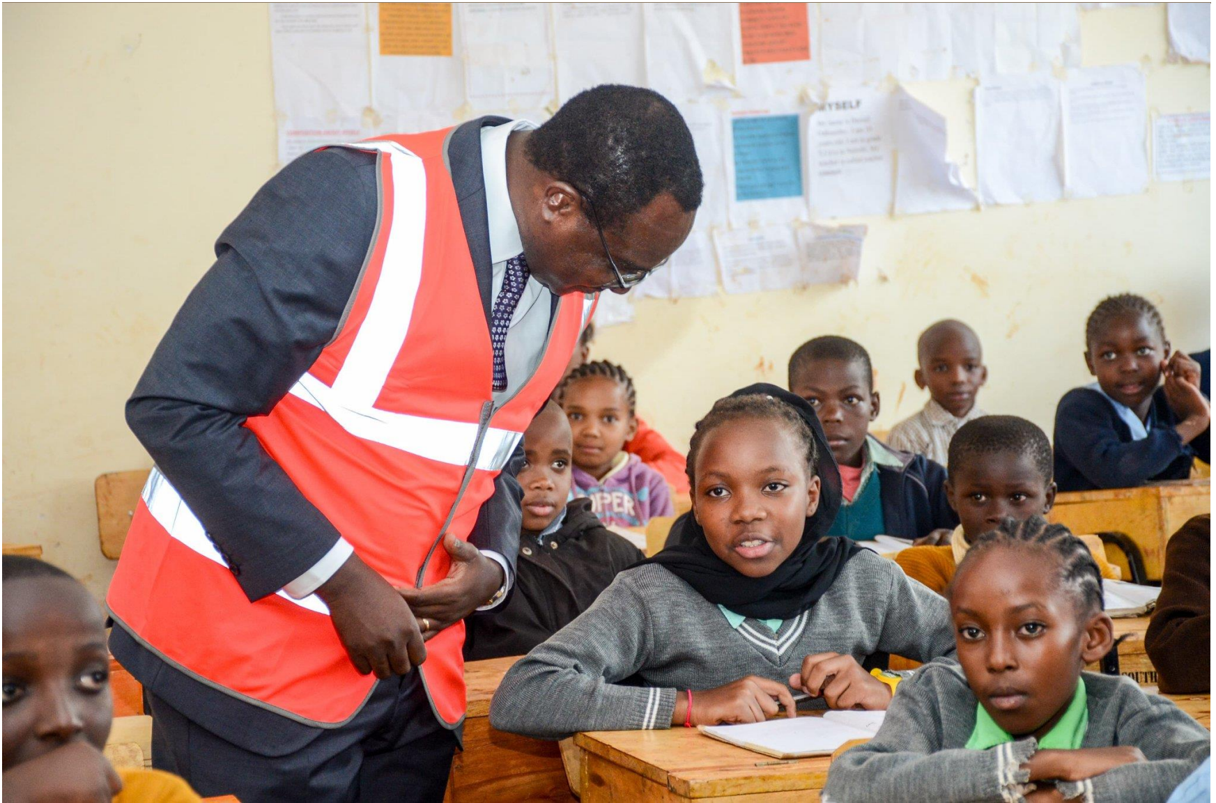
Kenya’s Education Cabinet Secretary engages grade 9 students as they prepare for the inaugural Kenya Junior Secondary Education Assessment (KJSEA) exams.