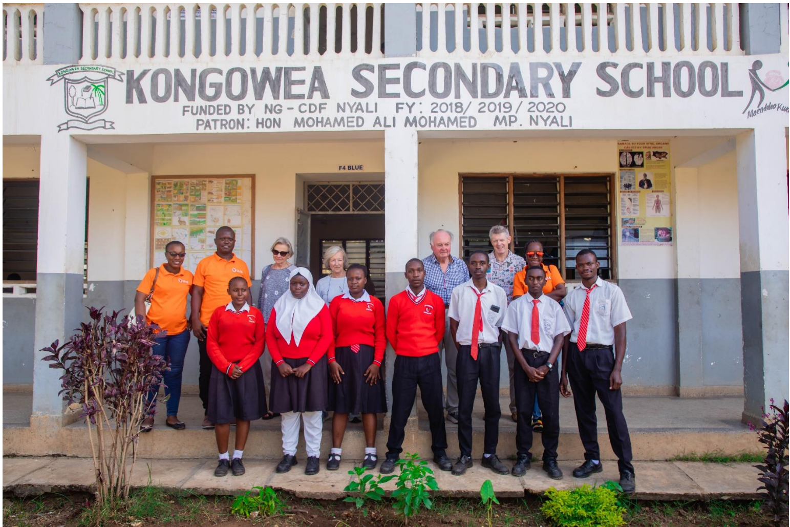
SAAS donors and sponsors alongside the SAAS staff in Mombasa pose for a group photo with SAAS-sponsored students at Kongowea Secondary School during the donors’ latest visit to Kenya in October.