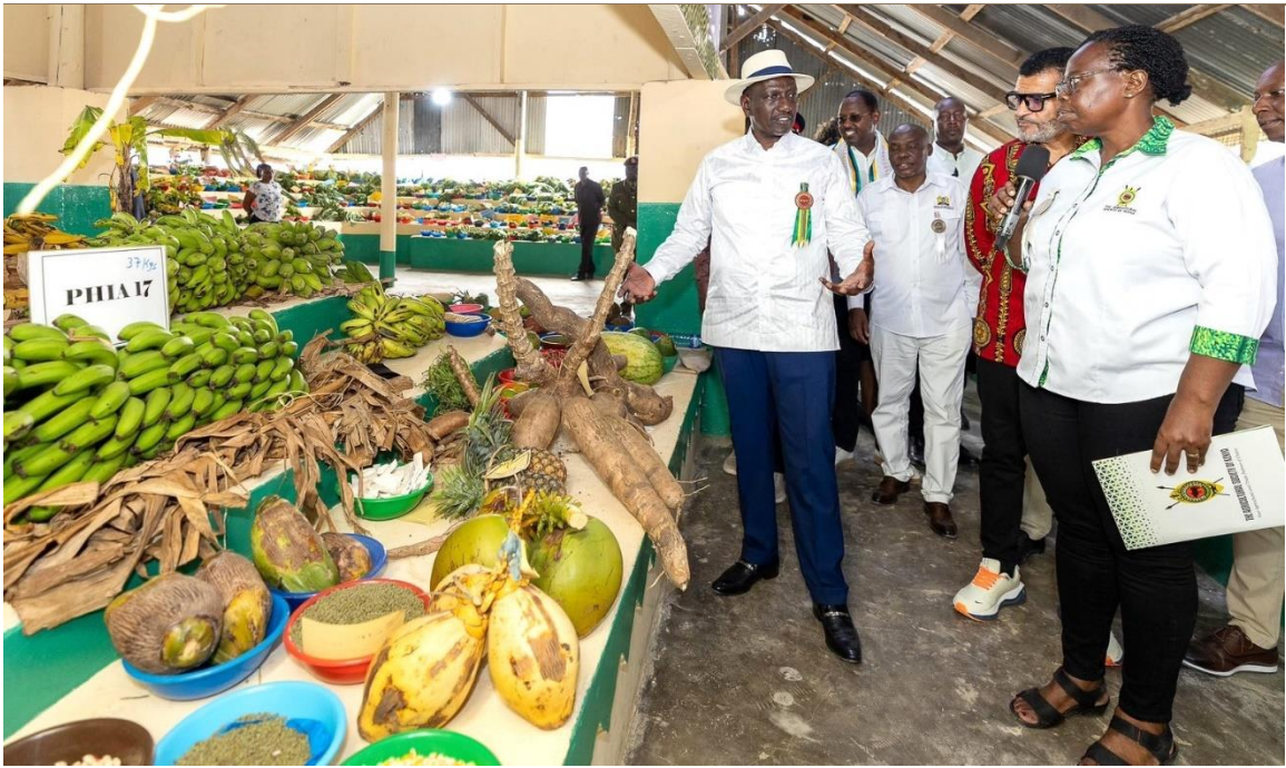
President William Ruto inspects agricultural products from the coast displayed when he officially opened the 122 nd edition of the Mombasa International Agricultural Show in September.