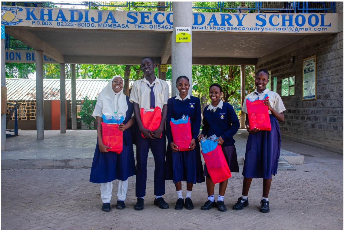
Khadija Secondary School students pose for a group photo with their gift hampers issued by the office when they visited them ahead of their exam period in October.