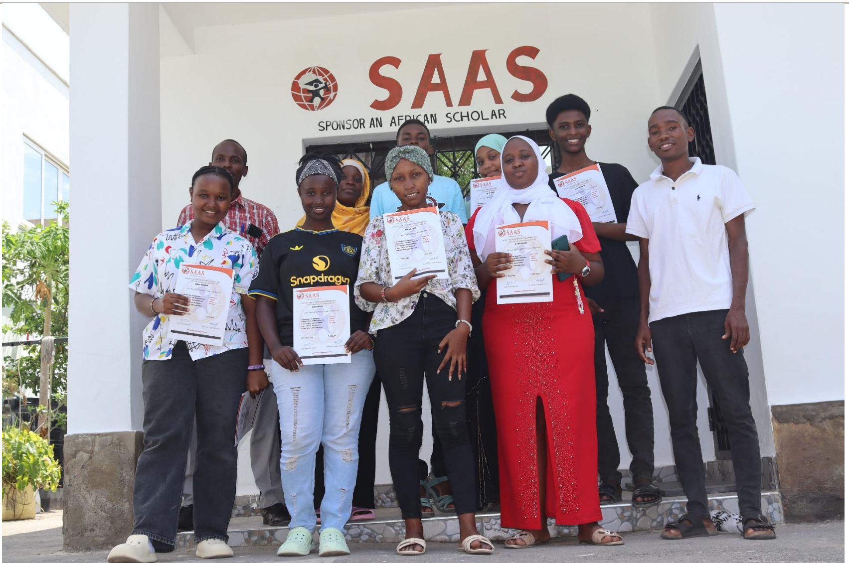
The September-December ICT cohort pose for a group photo with their certificates during their graduation ceremony at the office after satisfactorily completing the three-month course.