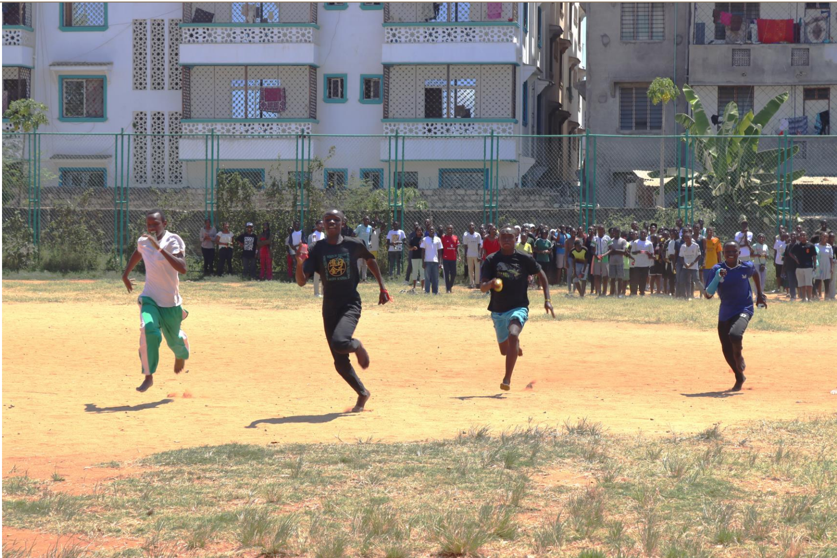
Students competing in a race during the Annual SAAS Fun Day 2025 edition held at the Kongowea Primary School Grounds on November 28, 2025.