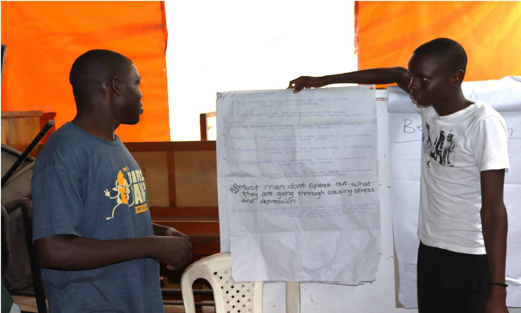
Some of the boys making a group presentation on mental stress and depression among men during the counselling and psycho-social session at the office in Mombasa, Kenya.