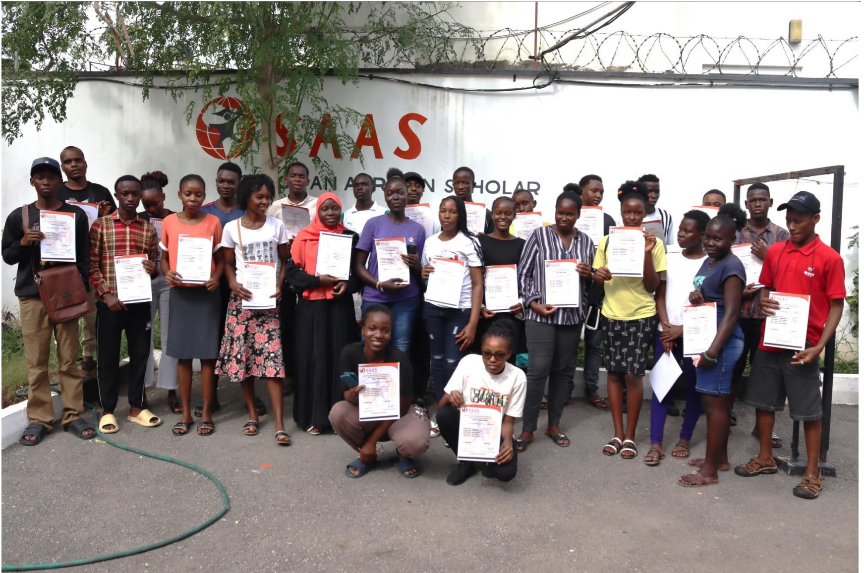
The May-August ICT cohort pose for a group photo with their certificates during their graduation ceremony at the office after satisfactorily completing the three-month course.