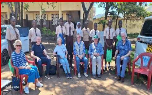
Our Donors and Sponsors pose for a group photo with students of Maweni Secondary School during their past visit to Kenya.

We are elated to announce that we will be receiving a team of donors and sponsors from the Kilquade and Greystones parishes in Ireland, who will be visiting Kenya in the month of October. While in the country on holiday, the team is expected to pay a courtesy visit to our office in Mombasa to catch up on the progress of our work. During their visit, they will have the opportunity to meet with some of the students they sponsor and visit a few of the schools where these students are enrolled. This visit marks a special moment of collaboration, gratitude, and mutual learning. We are very much looking forward to an enriching exchange and strengthening the bonds that keep our mission thriving. Stay tuned for updates and highlights from their visit in our next issue!