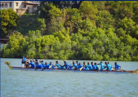
A team of fishermen paddle their boat in a dragon race during the first edition of the East African Ocean Festival in 2024

One of the festival's key goals is to raise awareness about protecting the marine environment, especially reducing plastic pollution, mangrove restoration, and sustainable use of waterfronts.