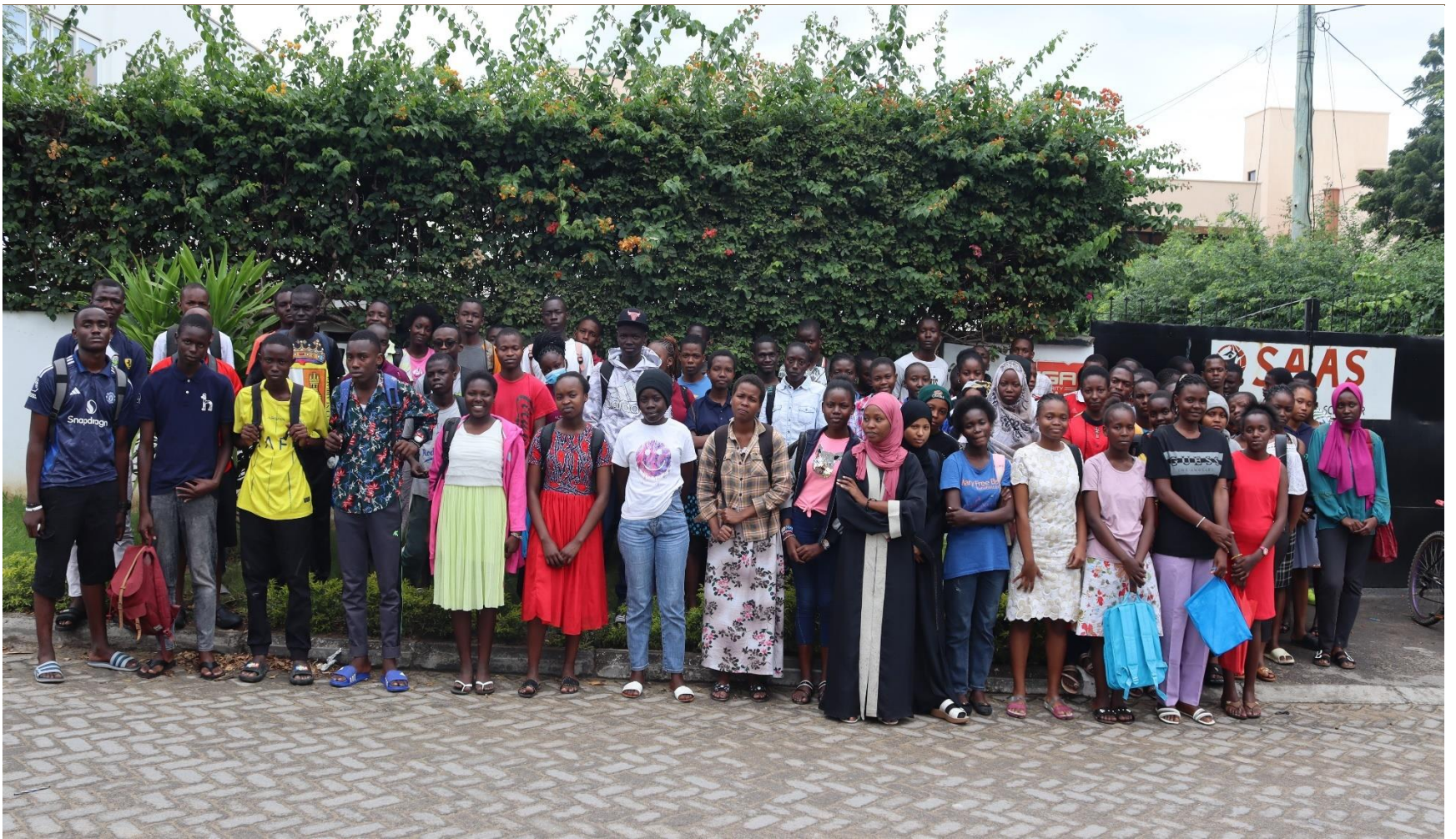
Students pose for a group photo before they head home after classes during the two weeks SAAS August holiday tuition program at the office in Mombasa, Kenya.