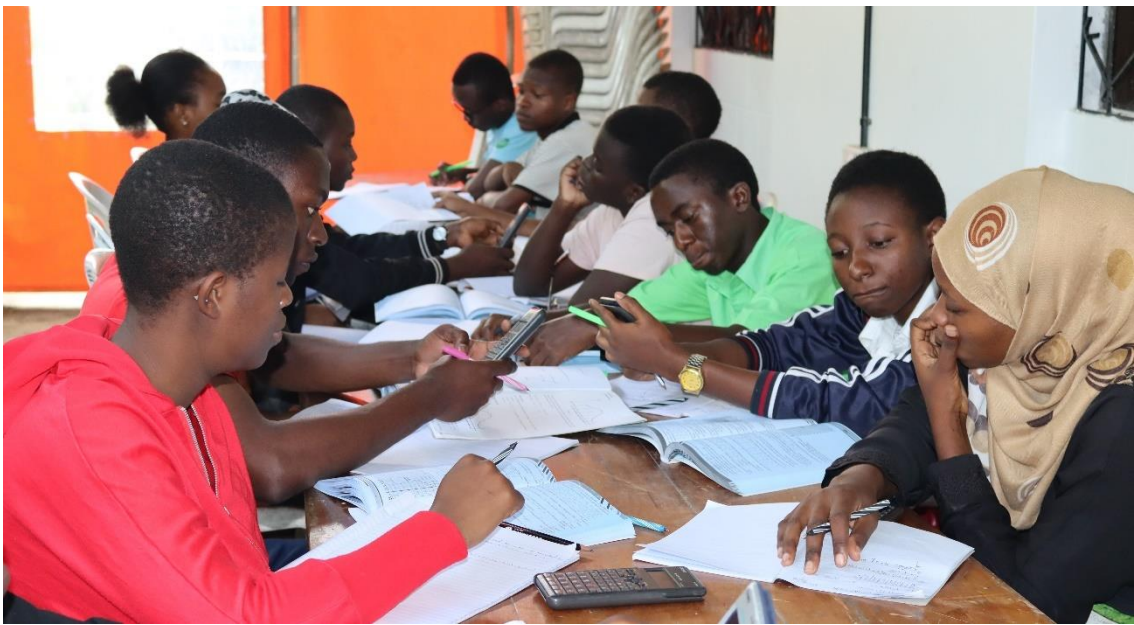
Some of our Form 4 candidates engage in a group discussion during the SAAS August holiday tuition at the office as they prepare for their KCSE exams this November.