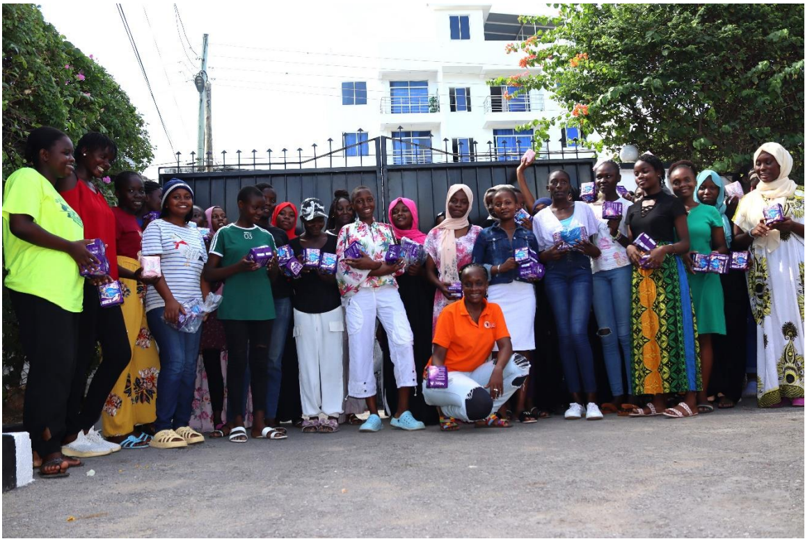
The girls are all smiles after receiving sanitary packs during the Girls and Boys Talk event at the office