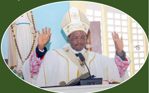
Mombas Archbishop Martin Kivuva presides the mass for the concertation of Kongowea’s new church building.

In 1954, due to hostility from the Muslim Brotherhood, the church relocated after purchasing land at its current location. They constructed a makuti-thatched church structure, where Kongowea Primary School's toilet block stands today.