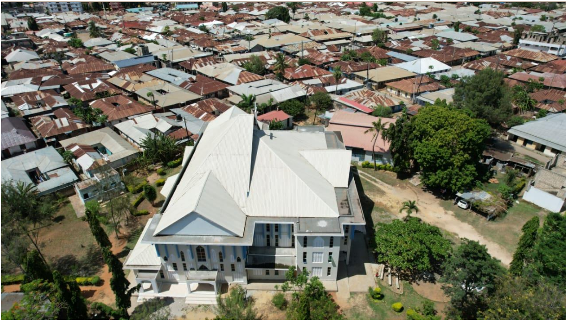
An aerial view of the new Kongowea Catholic Church two-story building overlooking the Kongowea slums.