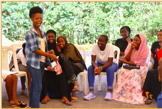
One of the girls demonstrate how to correctly wear a sanitary towel.

As we celebrate the achievements of the new graduates, we look forward to the next cohort, eager to continue our mission of equipping individuals with the skills necessary to thrive in the digital age.