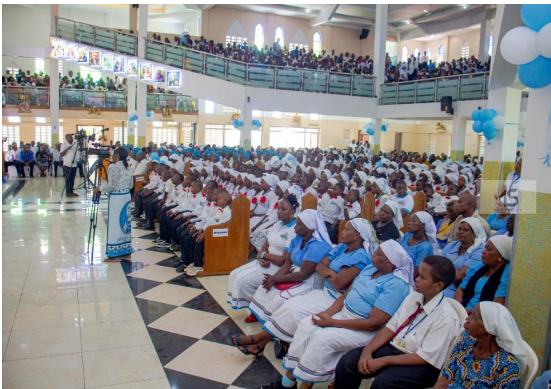
Parishioners keenly following mass proceedings during the opening of their new church