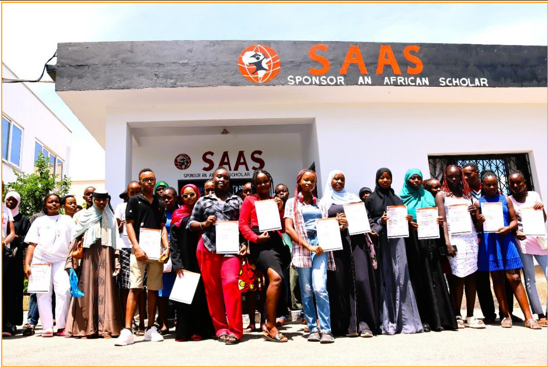
Computer graduates for the January – April intake pose for a photo during thier graduation day