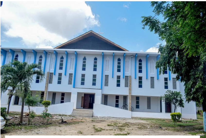
Rear view of Kongowea Catholic’s new church building