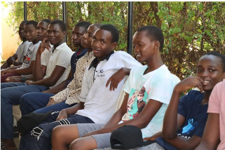
Boys Corner: the boys keenly following their session during the Boys and Girls talk event at SAAS