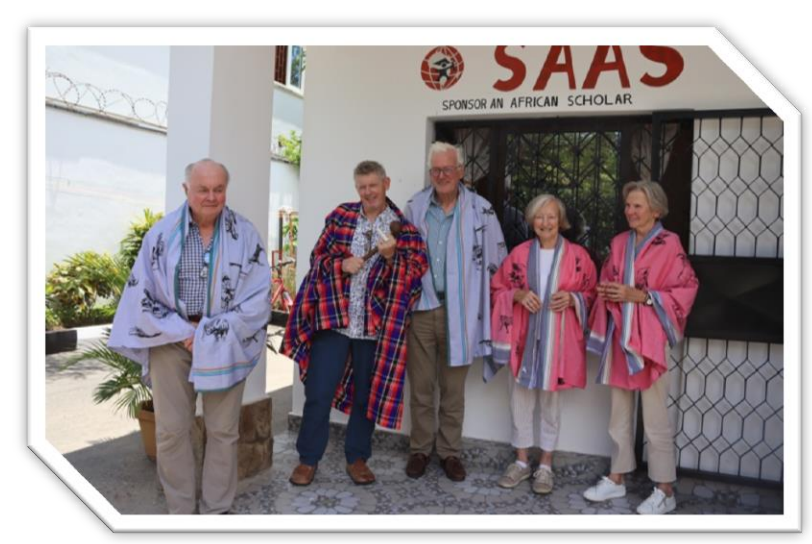
SAAS sponsors and donors pose for a photo with their gifts during their visit to the office in Mombasa, Kenya earlier in October