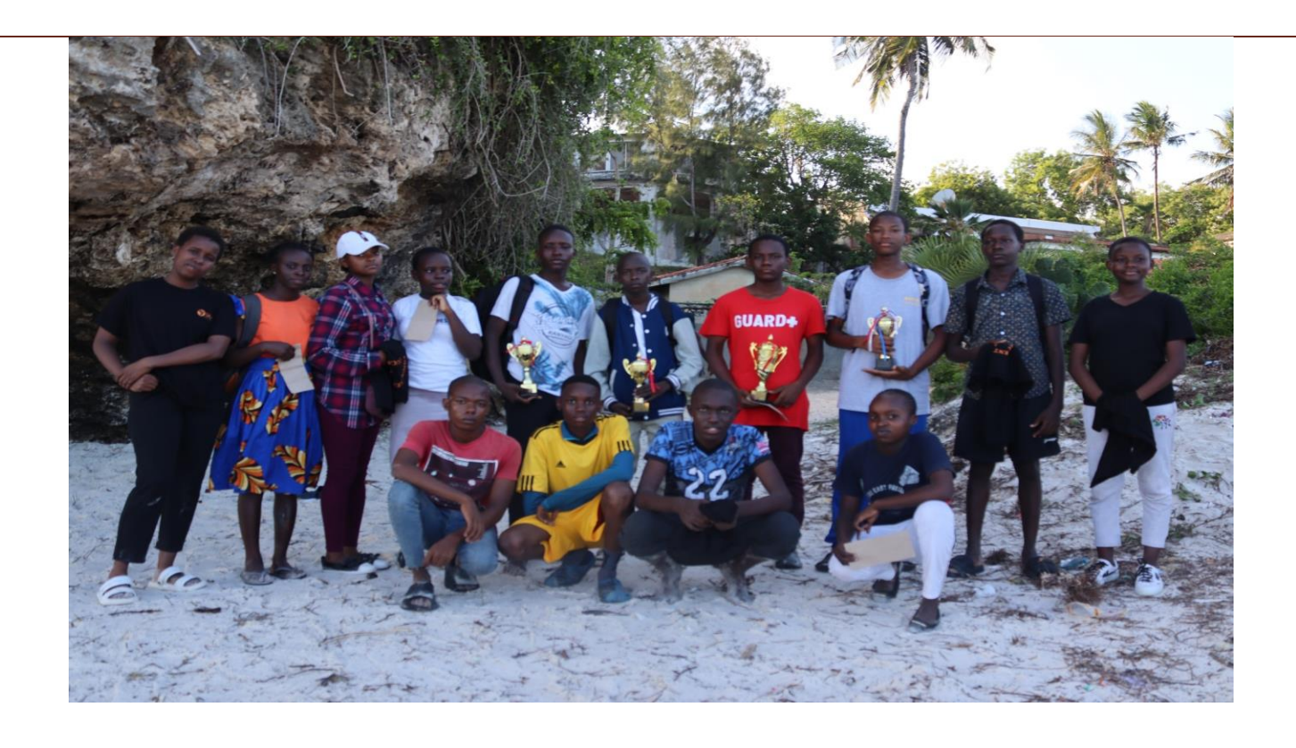
The SAAS best students in 2024 pose for a group photo with their awards during the Annual SAAS Fun Day event held at Nyali Beach on November 29, 2024