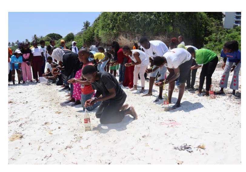
Students compete in the fill the bottle challenge during their fun day

The girls pose for a photo after receiving their sanitary packs during the Boys and Girls Talk event at the SAAS office in Mombasa, Kenya.